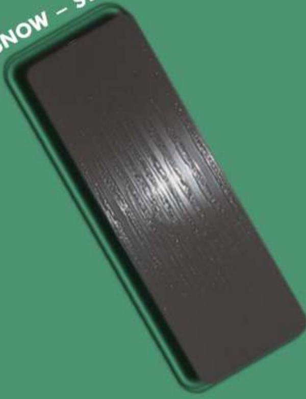
SNOW – SW