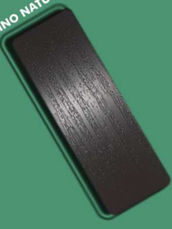
FRASSINO NATURALE – FN