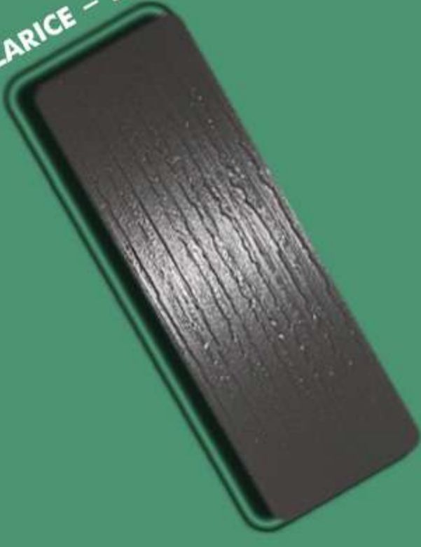
LARICE – LR