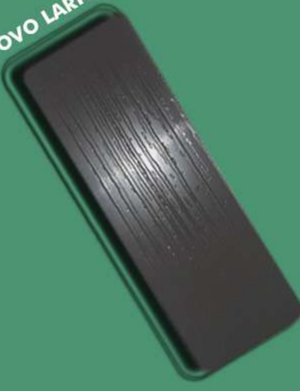
NUOVO LARICE – NL