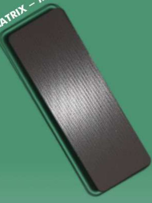
MATRIX – MX