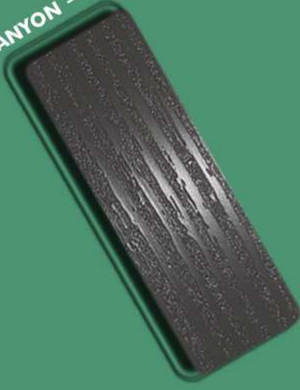
CANYON – CY