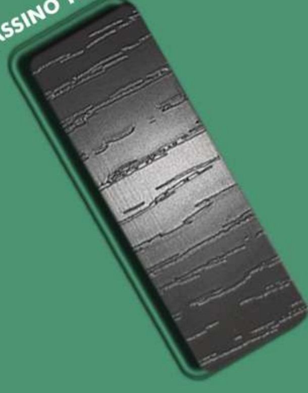
FRASSINO TRAV – FT