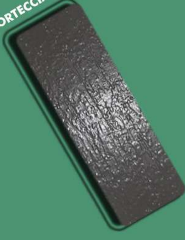
CORTECCIA – CT