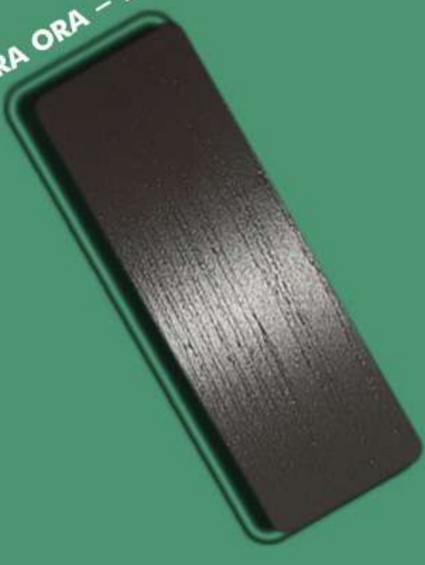
ERA ORA – EO