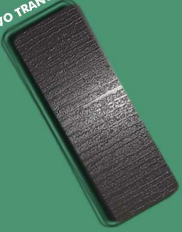
NUOVO TRANCIATO – NT