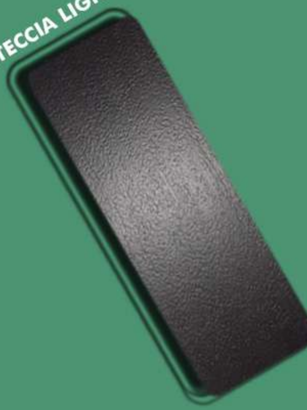
CORTECCIA LIGHT – CH