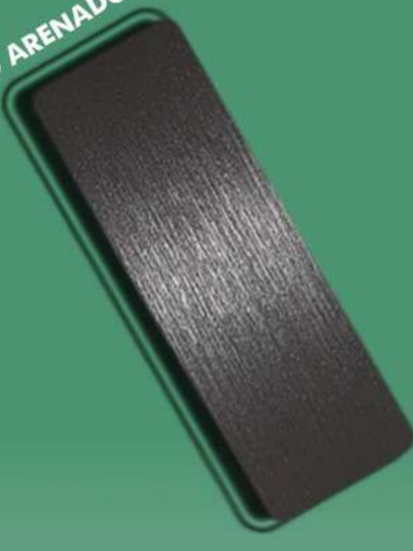
PORO ARENADO – PA