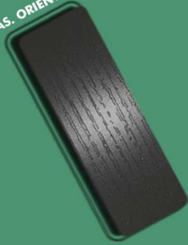
FRAS. ORIENT. – FO