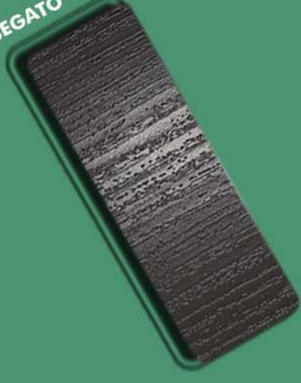
SEGATO – SG